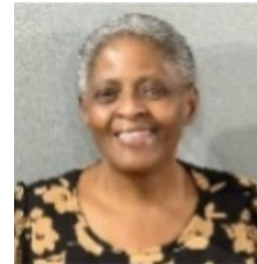
Carolyn Markland Communications